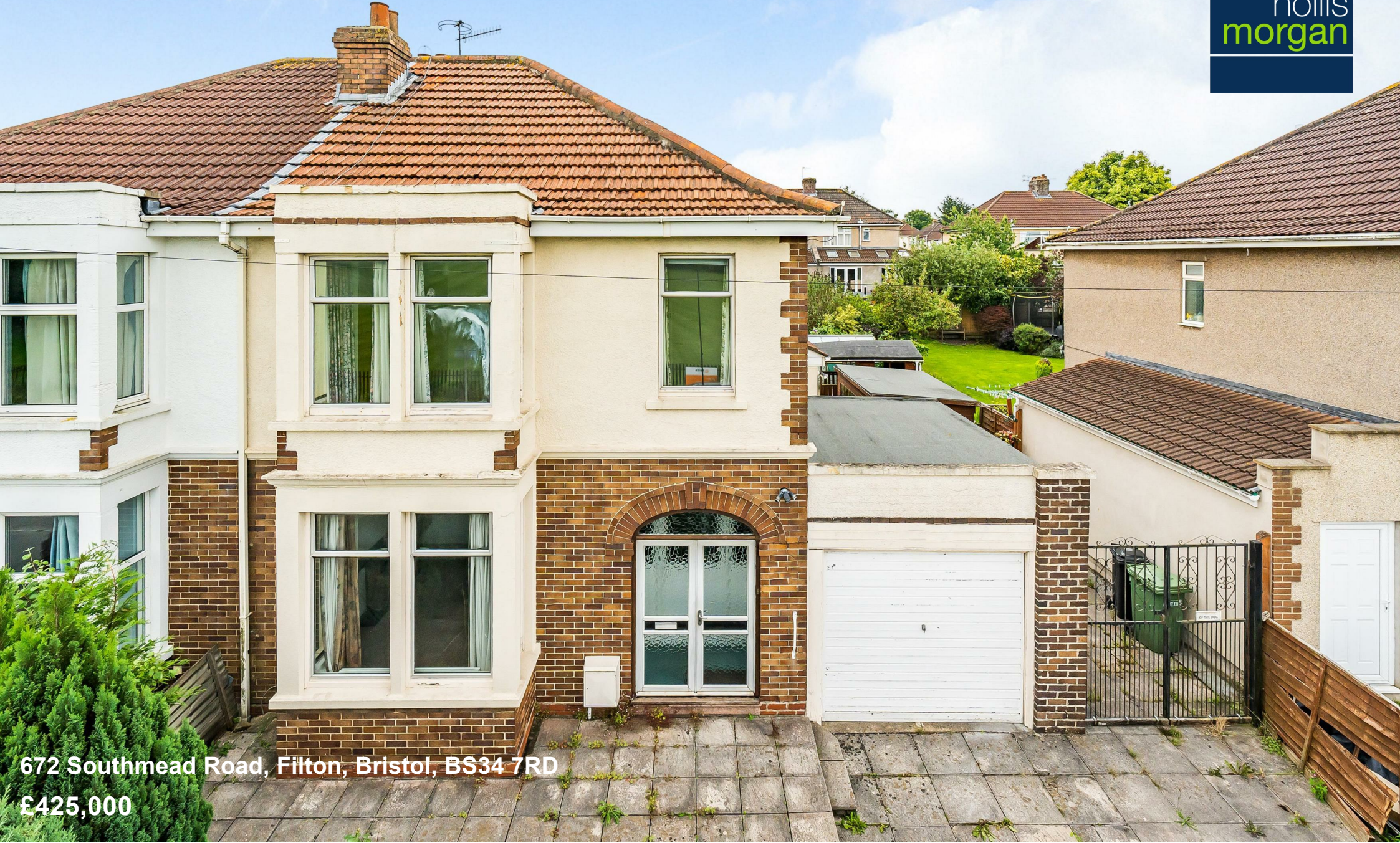
672 Southmead Road, Filton, Bristol, BS34 7RD